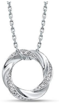
The ING Collection "CHOW TAI FOOK LOOP" series

The ING Collection "CHOW TAI FOOK LOOP" series, inspired by the romantic Möbius strip, brings out the eternal and endless meaning with the beautifully twisted circles. The intertwining silhouette, from sections, materials and number of rings, presents the unique form of Möbius strip and the everlasting style. It also embodies an boundless love and an perpetual journey with loved one. The minimalist and precisely touched design of the ING Collection "CHOW TAI FOOK LOOP" series, and the captivating Gold Bangle, as the centre of the whole collection, are definitely the finishing touches to different outfits while embodying meaning of endless love into daily life.