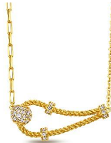
The ING Collection "CHOW TAI FOOK KNOT" series

The ING Collection "CHOW TAI FOOK KNOT" series, proudly interprets the precious commitment of every couple. The fashionable, impeccably executed double-knot design, where showcasing the round beads as the knots, has reflected a different shimmering effect on different textures. The bracelets and rings in the ING Collection "CHOW TAI FOOK KNOT" series, showcasing a design of combining the bracelet and ring together, implement the meaning of everlasting promise and the unbreakable connection with loved ones.