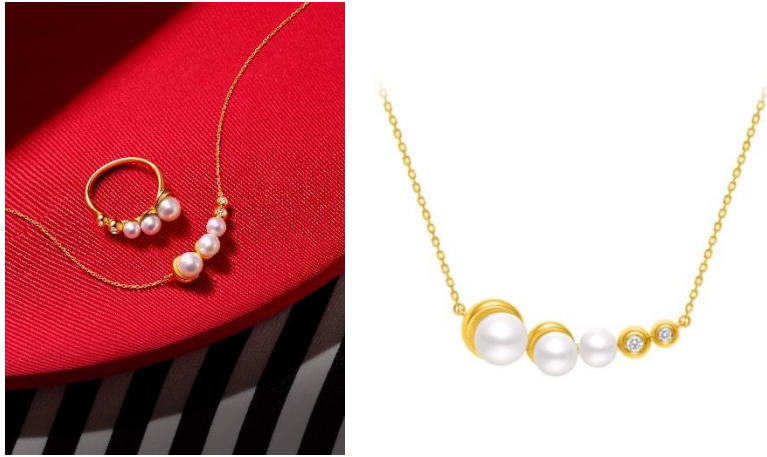
The Chow Tai Fook LUNA series

The LUNA series manifests the beauty of nature with innovative designs and witted craftsmanship. The pieces feature pearl as the moon, capturing the journey of women's self-understanding process through the changing of the moon. The delicately selected pearls by Chow Tai Fook, showing a moonlight-like glow. With an romantic encounter to the 18K gold diamond circular bases, these pearls are presented as the moon's reflection of the water. The craftsmanship of the pearls pursues perfection in details, each pearl's back are featured with a moon-phase shape embracing a star, capturing the beautiful connection and imagination between the moon and stars into eternal boundless love.