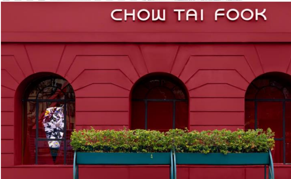
Somekh Building exterior during the "Beyond Time" natural diamond exhibition