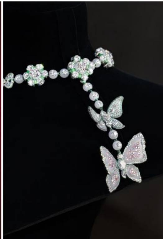
"A Heritage in Bloom" jewellery masterpiece and its exhibition zone