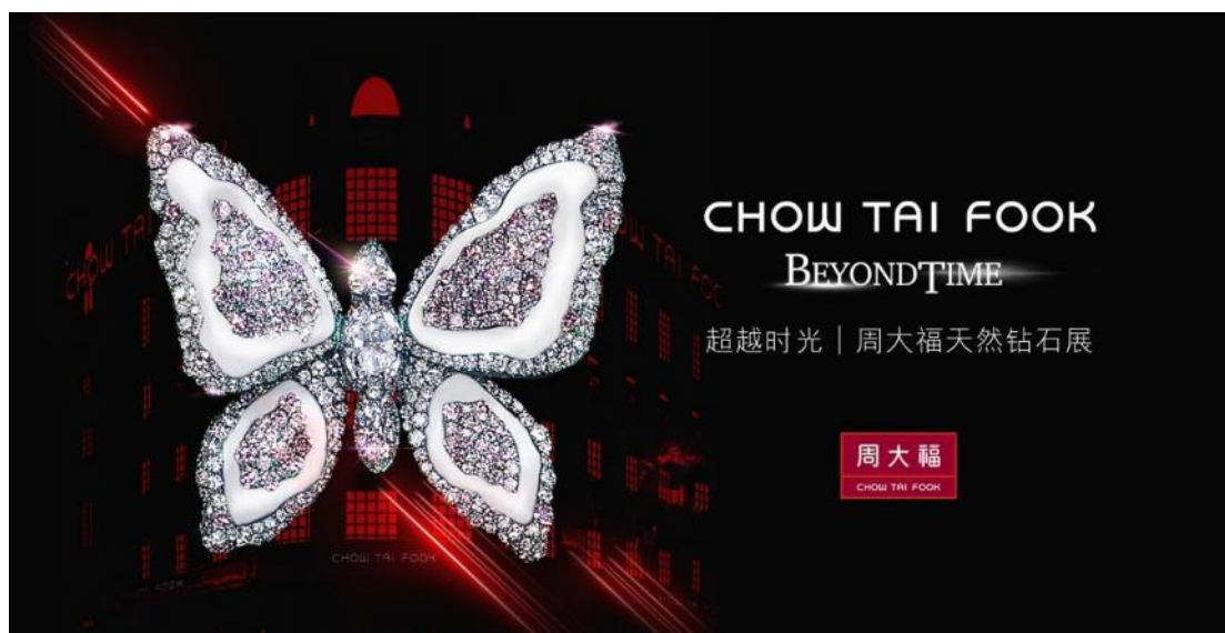
Chow Tai Fook “Beyond Time” natural diamond exhibition

On 6 th March, Chow Tai Fook hosted its "Beyond Time" natural diamond exhibition at the historic Somekh Building in Shanghai. The exhibition features its masterpiece "A Heritage in Bloom" and other exquisite treasures, a showcase of how these enduring natural diamonds convey timeless sentiments through their unyielding brilliance.