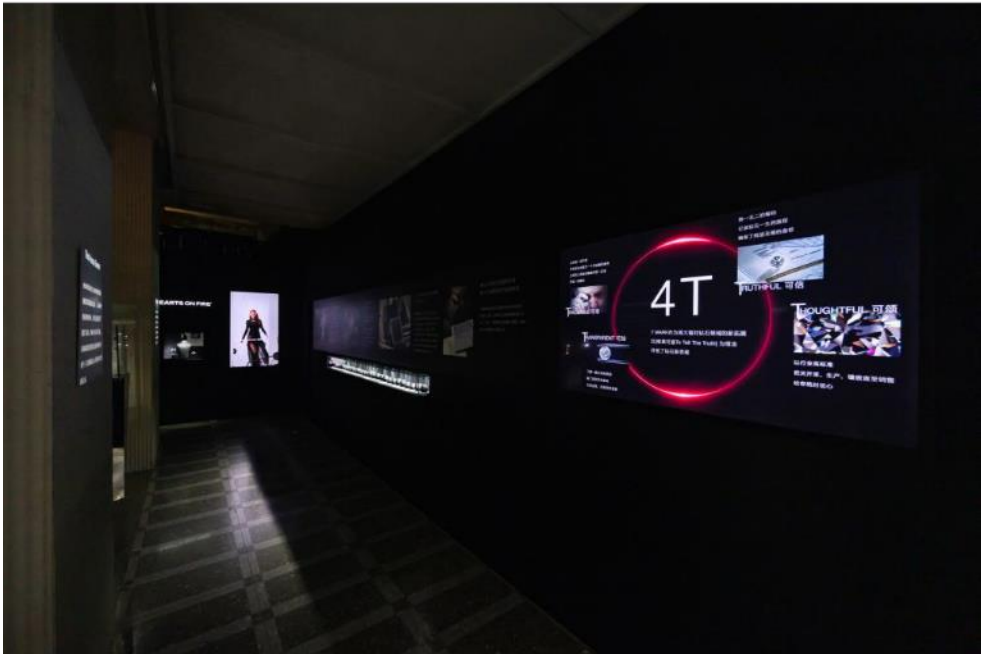
The History Corridor at the "Beyond Time" natural diamond exhibition