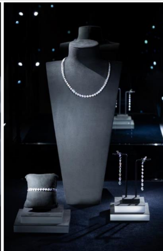
Jewellery exhibits from HEARTS ON FIRE