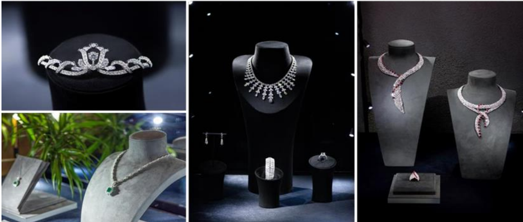
Chow Tai Fook’s jewellery pieces