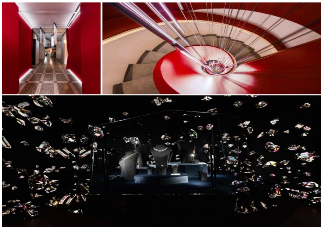
The entrance corridor and 3D display at the “Beyond Time” natural diamond exhibition

Participants begin their journey through Chow Tai Fook’s magnificent curation as they walk down a red corridor reminiscent of diamond cuts. Once they enter the exhibition, the first thing they encounter is a storyboard describing the origins of natural diamonds. Through 3D images that bring this scene to life, visitors learn how natural diamonds undergo changes in the earth’s crust and emerge from volcanic eruptions to become glittering treasures.