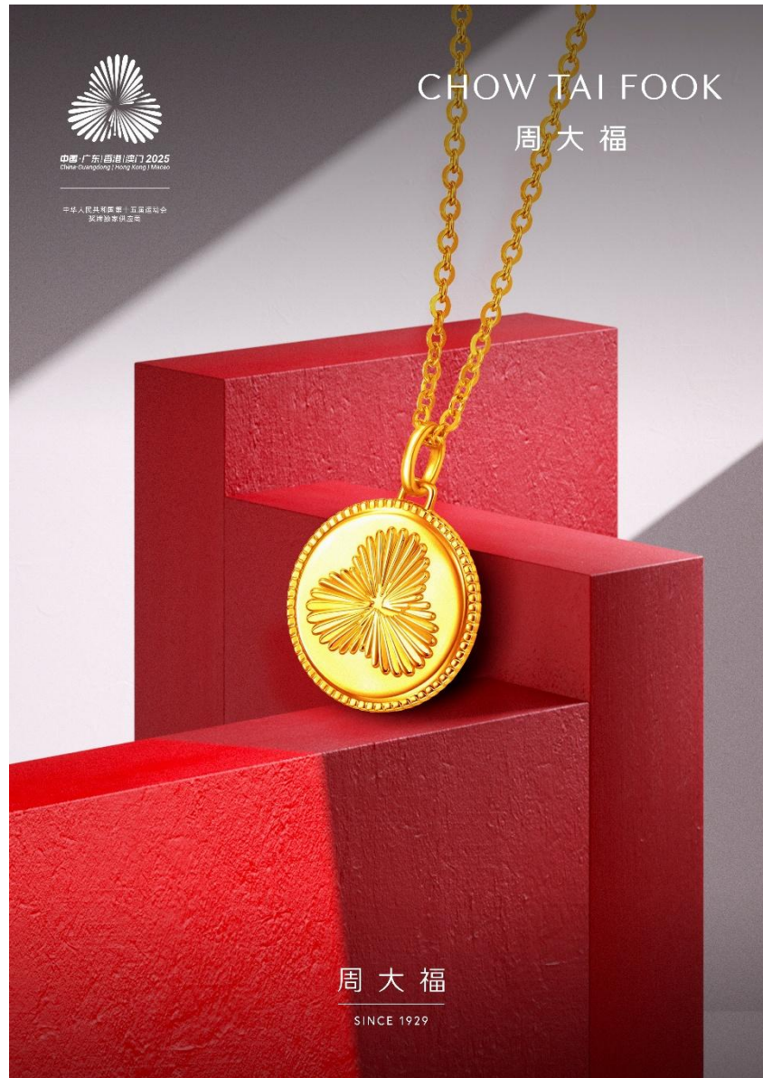
Chow Tai Fook × National Games Collection Officially Unveiled

September 19, 2025 —The 15 th National Games of the People's Republic of China ("15 th National Games") will officially open on November 9, sparking major excitement nationwide. Chow Tai Fook Jewellery Group Limited ("Chow Tai Fook Jewellery Group", "Chow Tai Fook Jewellery", the "Group" or the "Company"; SEHK stock code: 1929), today proudly unveils the Chow Tai Fook × National Games Collection. Inspired by the 15 th National Games emblem, medals and iconic elements, the Collection captures the strength and beauty of competitions in exquisite designs.