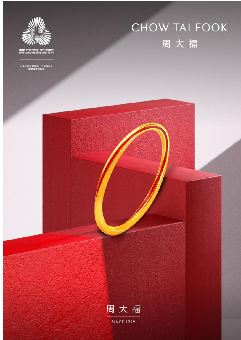
Chow Tai Fook x National Games Medal-Inspired Bracelet

In addition, the mascots of the 15 th National Games, "Xiyangyang" and "Lerongrong", are artfully woven into the designs. They are reimagined as lucky beads depicting sports such as diving, fencing, and dragon boat racing, conveying a vibrant and uplifting attitude to life. There are also themed designs inspired by the regional culture, such as Guangzhou, Hong Kong and Macao, highlighting both the unique allure of the Greater Bay Area and the inclusiveness and harmony of Chinese culture. Completing designs are these exquisite and stylish gold medallion pendants, versatile enough for daily wear, collecting, and gifting, combining versatility with playful charm.