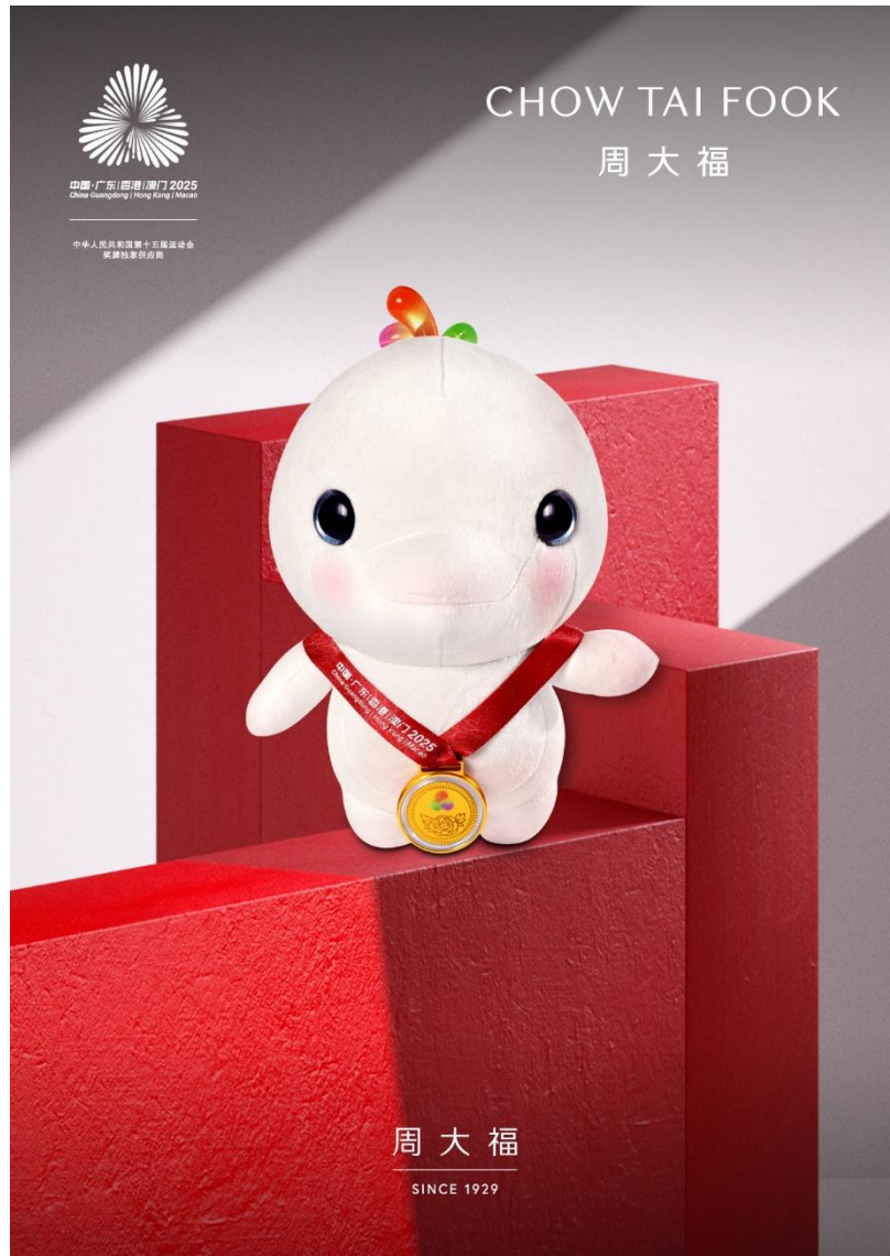
Chow Tai Fook x National Games Mascot-Inspired Gold Medallion Pendants