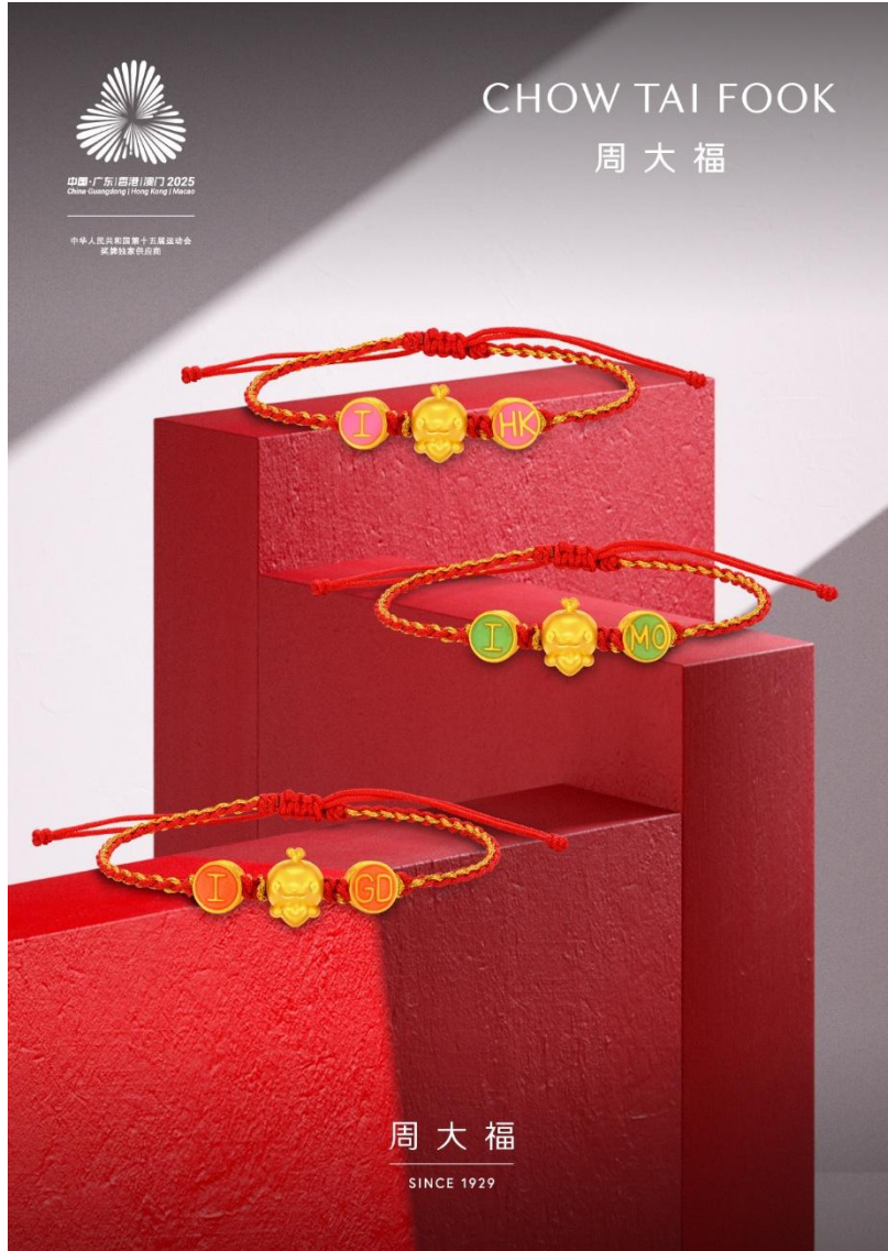
Chow Tai Fook x National Games Mascot-Inspired Lucky Bead Bracelet