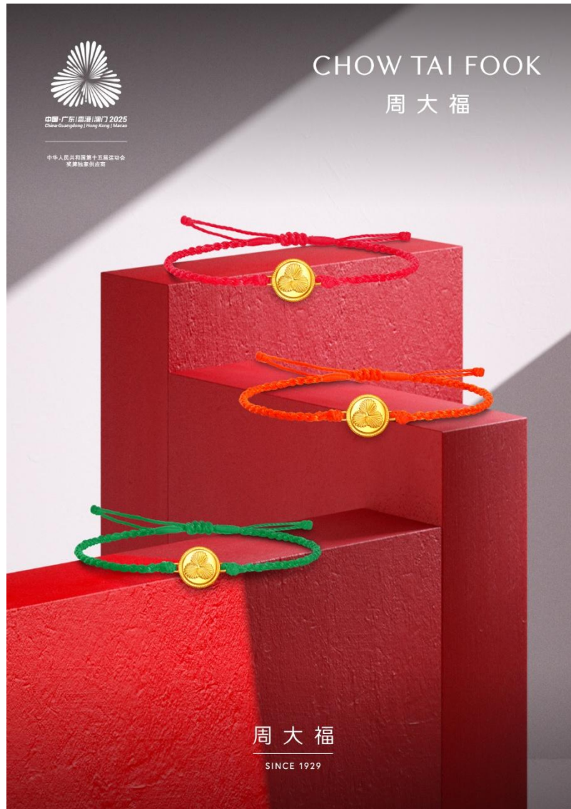
Chow Tai Fook x National Games Emblem-Inspired Three Flower Colours Bracelet

In designs mainly drawing inspiration from medals, Chow Tai Fook creatively transforms the möbius rings encircling the medals into the central motif of the jewellery. This timeless symbol of eternity and continuity is reimagined in a minimalist and modern design language. The piece faithfully echoes the 66 finely engraved ridges on the outer ring of the medal, a tribute to the 66 glorious years since the inaugural National Games in 1959. These designs are further adorned with Chow Tai Fook's signature "Timeless Red", bringing energy and vibrancy to each piece. This hue symbolises the harmony, unity, and boundless vitality of the Guangdong-Hong Kong-Macao Greater Bay Area.